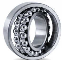
SELF-ALIGNING BALL BEARING