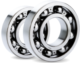
RADIAL BALL BEARING