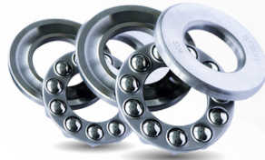
THRUST BALL BEARING