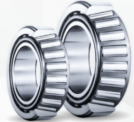
TAPER ROLLER BEARING