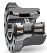
TRUCK & TRAILER HUB BEARING