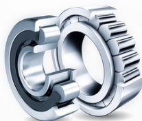
CYLINDRICAL ROLLER BEARING