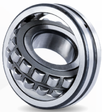
SPHERICAL ROLLER BEARING